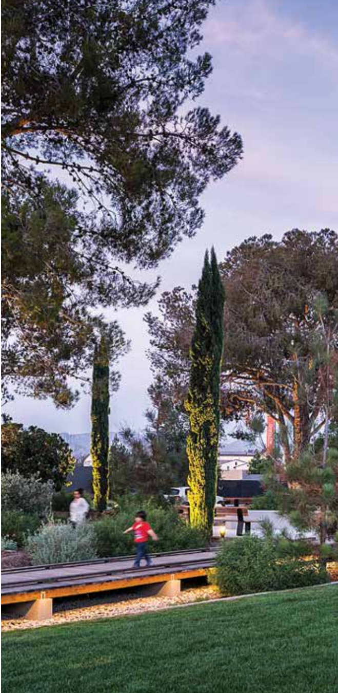
CADENCE PARK ▲