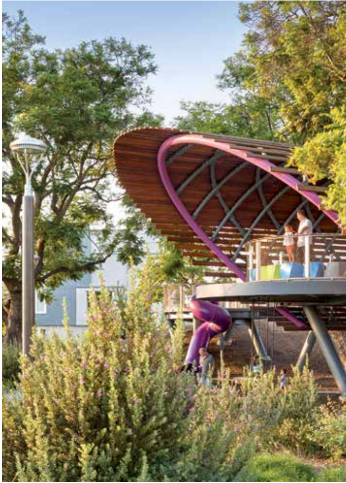
BEACON PARK ▲