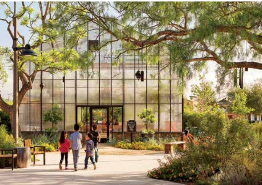
▲ PAVILION PARK