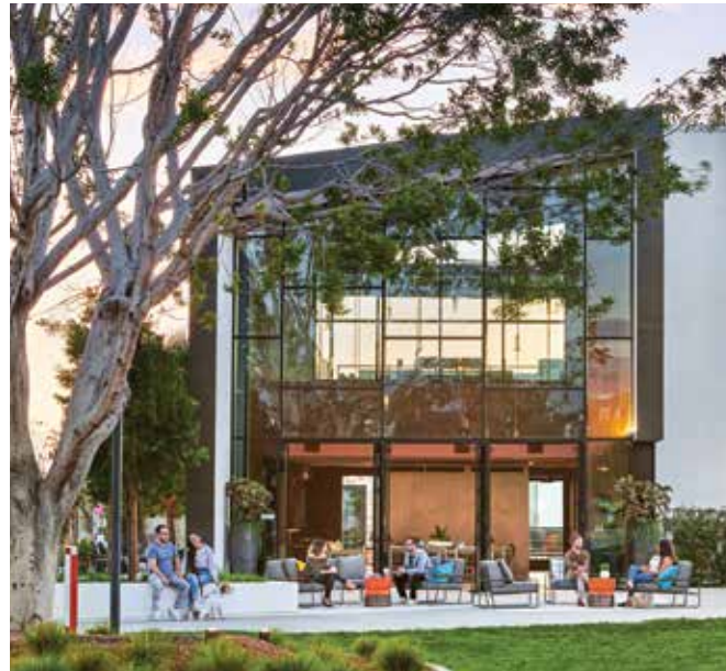
▲ NOVEL PARK