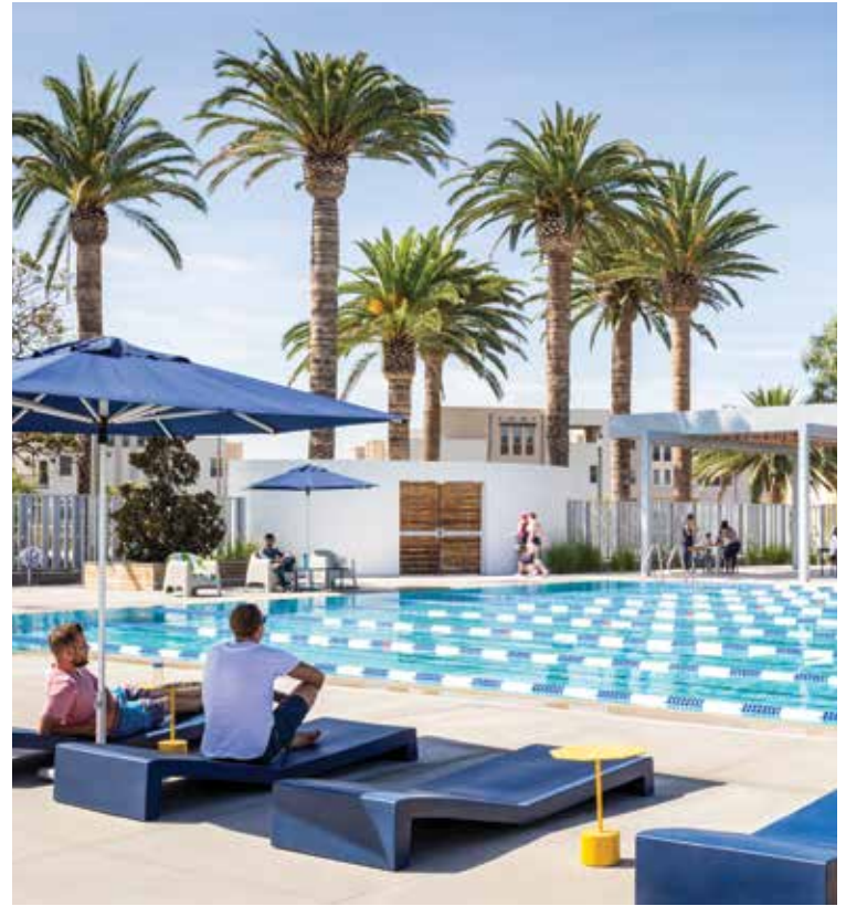
THE POOLS ▲